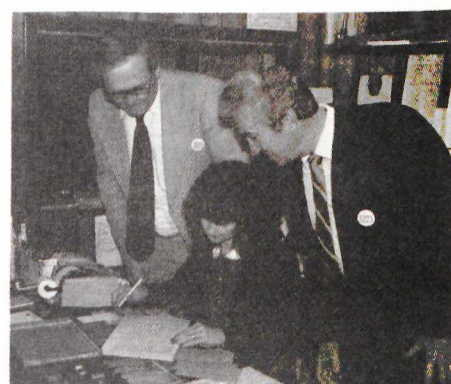
S.S. Supt., Asst. Supt. and Secy.