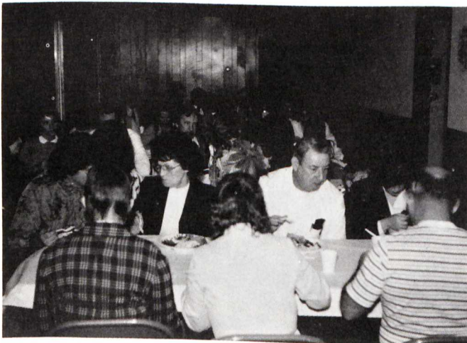
Homecoming Dinner at Oak Hill