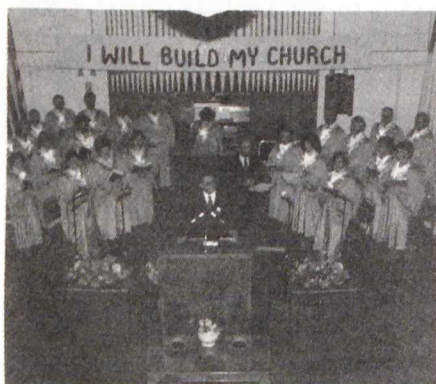
Pastor and choir