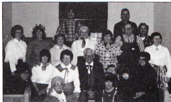
Part of the congregation at Leadington