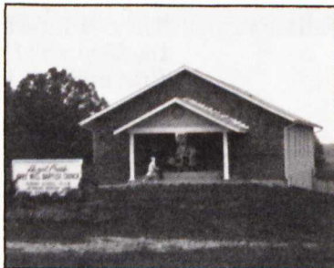
Hazel Creek Church Building