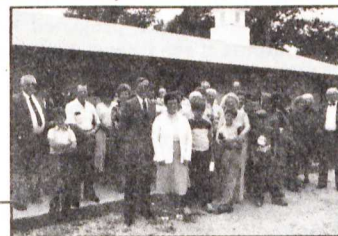
Jones Creek Congregation