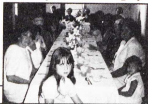
Mother & Daughter Banquet