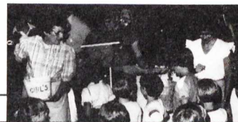
VBS at Monett