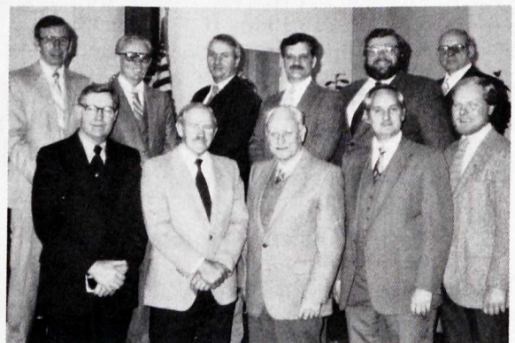
The pastor and board members, Calvary Fellowship

The pastor states, "Last year at the first banquet, it was with fear and trembling that we increased our weekly budget from $1,800.50 (which we weren't meeting) to $2,208. Our offerings averaged $2,600 per week in 1984. This banquet has been a contributing factor to the increase in giving at Calvary."