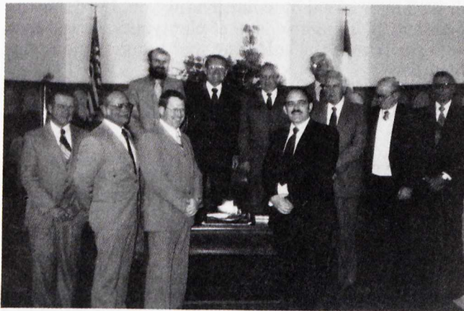
Pastor and board members