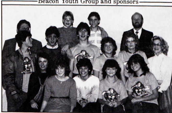
Beacon Youth Group and sponsors

Matthew 25:40 "Inasmuch as ye have done it unto one of the least of these my brethren, ye have done it unto me."