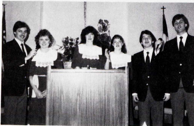
New Life Singers