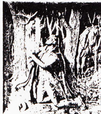
General George Washington in Prayer at Valley Forge United States Sub-Treasury Building, New York, New York