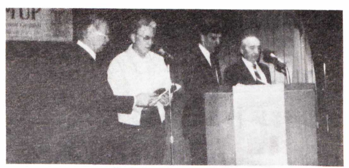
Men's Quartet - Grace Church

The ladies of the church prepared a delicious dinner that was enjoyed in Fellowship Hall by everyone.