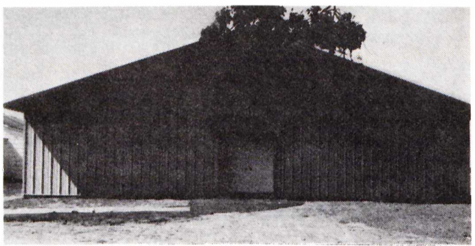
Arbor Grove Church