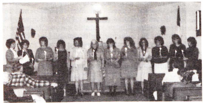
Woman's Auxiliary Service at Oak Hill