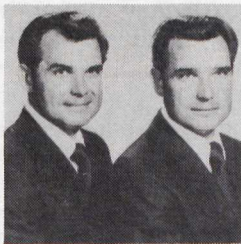
The Worthington Twins

Located 1 mile north of Fredericktown on US 67 at Catherine Place