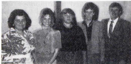
Unity Christian Academy Staff