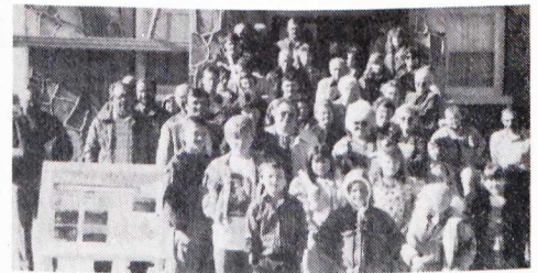
Rock Chapel Congregation