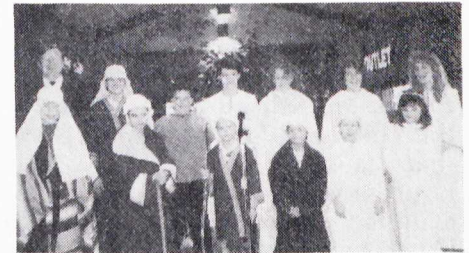
Wentzville Musical Group

In 1990 I have simply asked the Lord for 300 individuals or churches to give an offering of $300, at one time or monthly. The total would be $90,000. It sounds like an incredible impossibility, but with 10,000 Free Will Baptists strong here in Missouri who love the Lord and His church, nothing is impossible with God. Gideon only had 300 men who defeated the 200,000 Midianite army because they put their trust in the Lord. Our God can do the same today.