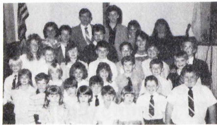
Unity Christian Academy Students & Staff