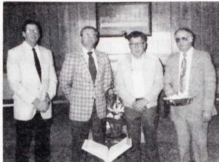
Pastor and Deacons