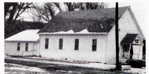
Merl's Chapel Church

We covet earnestly the prayers of our Free Will Baptist brethren. May this letter serve as an encouragement to that which God can do.