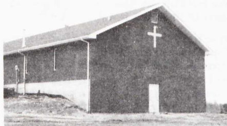
United Church Addition - Back View