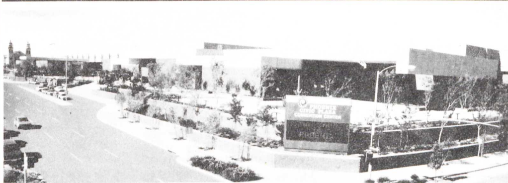
PHOENIX CIVIC PLAZA