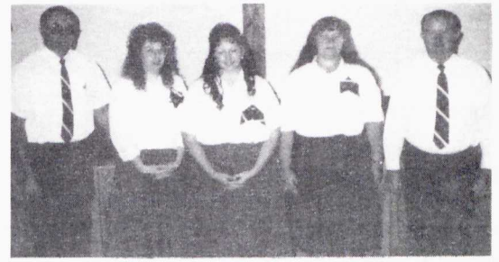
The Pastor, Principal and Staff