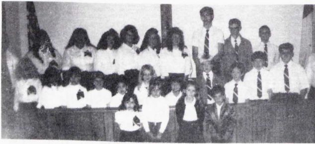
The Student Body