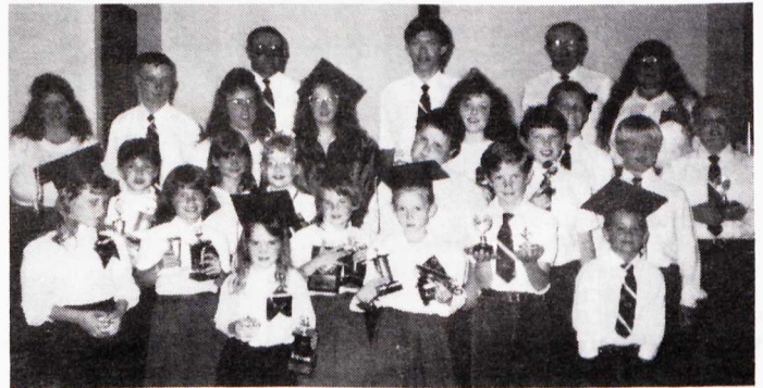
Unity Christian Academy