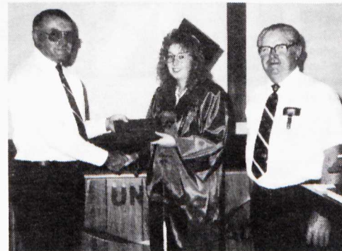
The graduate, pastor, and principal.