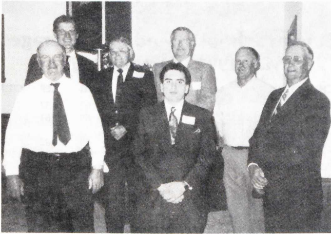
The Pastor and Church Board

EDITOR'S NOTE: Congratulations to this fine church, the Verdella Free Will Baptist Church, for its long and faithful service to the Lord.