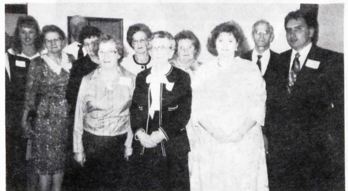
Members with 25 Years and More Membership with Pastor and Wife