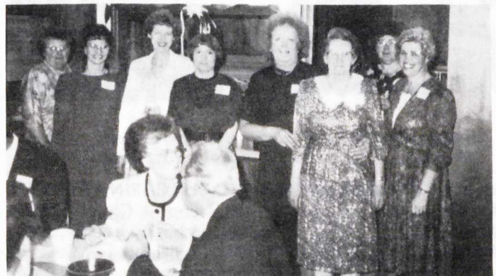
The Wonderful Ladies of the Kitchen and Dining Area