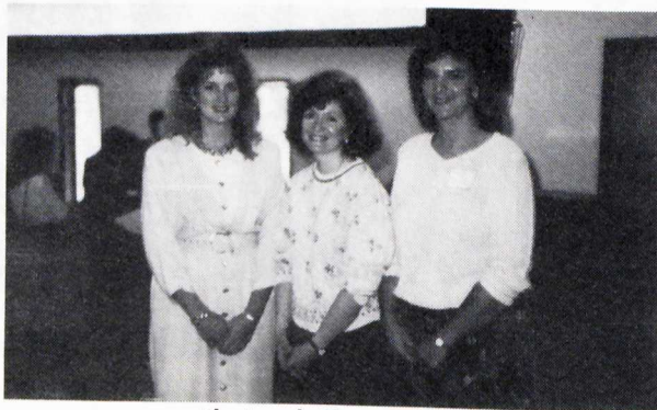
The Lovely Three Soloists