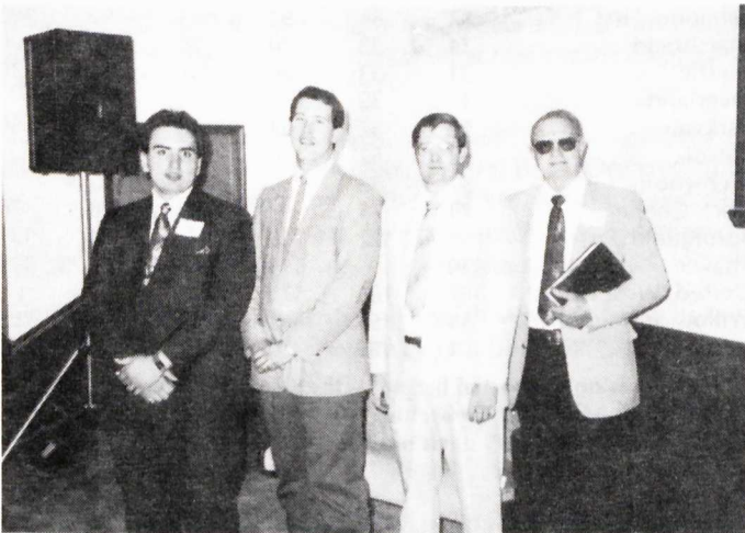
The Pastor and Former Pastors