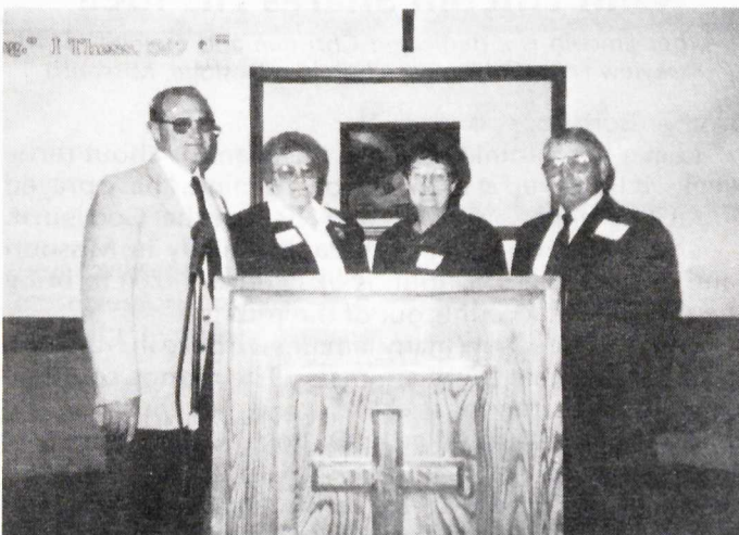
The Former Church Quartet