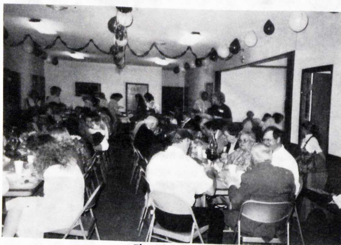
The Dining Area