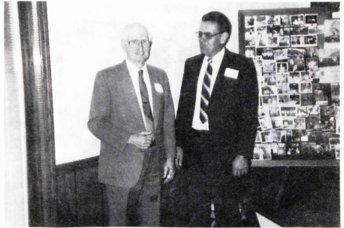
The Sunday School Superintendent and a Visitor