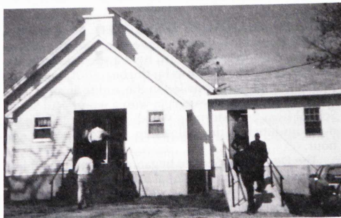
Black Oak Church

DEDICATION SERVICE AT BLACK OAK — On Sunday, November 3, 1991, the Black Oak Free Will Baptist Church held a Dedication Service for the new Fellowship Area/Classrooms Addition to the present building.