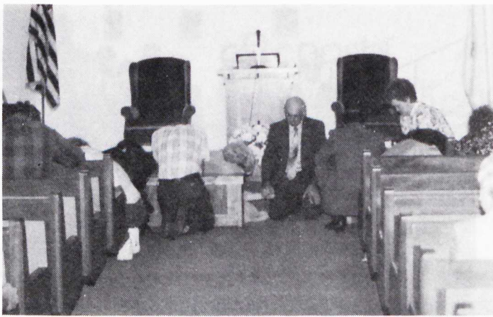
Prayer of Dedication

CHURCH FURNITURE DEDICATED AT CONWAY CHURCH — On Sunday, September 29, the Calvary Church at Conway, Missouri, held a special Dedication Service. The dedication was for the beautiful new padded pews that had been installed in the auditorium.