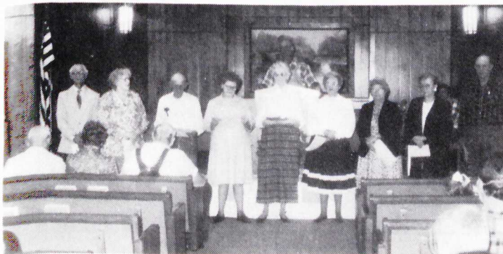
Honorees at Rock Chapel