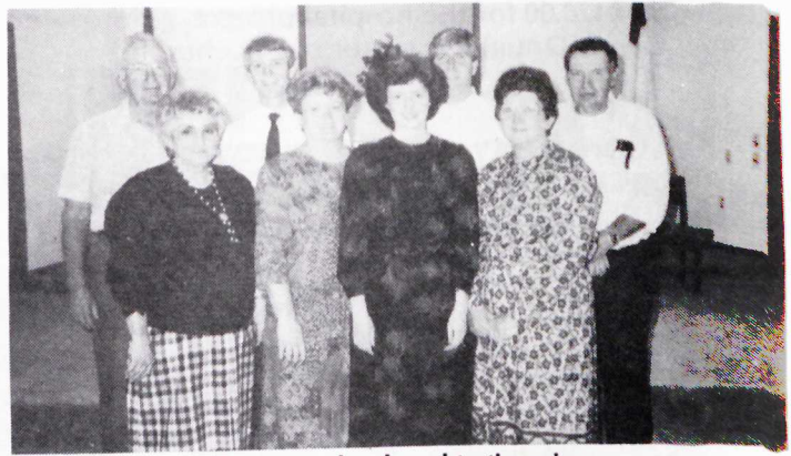
The ones who shared testimonies

The Afternoon Service was a time of thanksgiving. Many shared their testimonies of the blessings the Lord had given in their fellowship with the Calvary Chapel Church and in the community. One of the new members said, "I have enjoyed this day. We do have something for which to celebrate!"