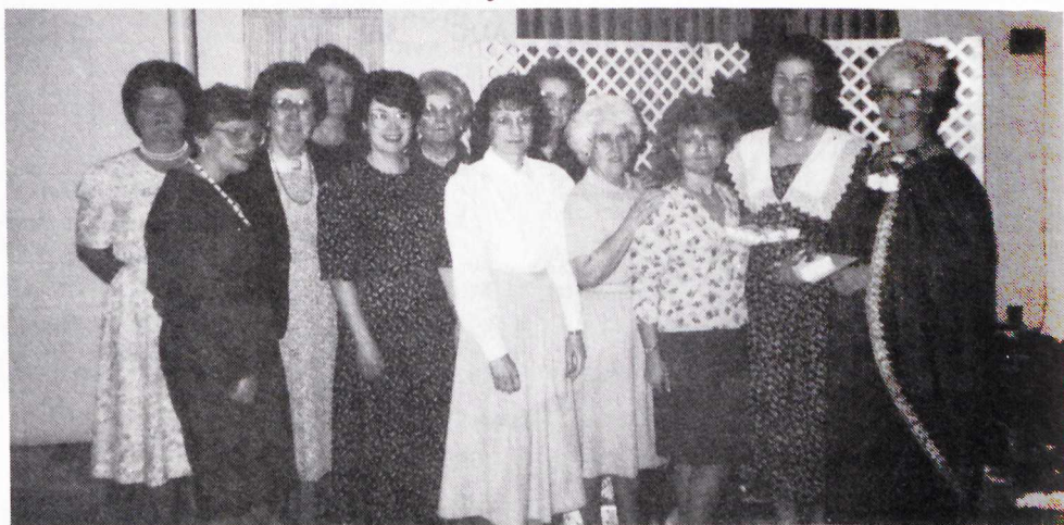
Marie Hanna Woman's Auxiliary Members