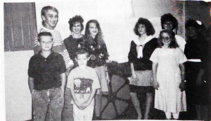
Young people at chuck wagon