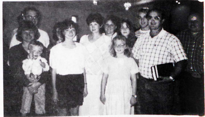
A happy group