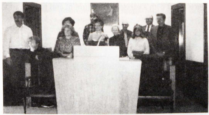
Choir - Coppermines