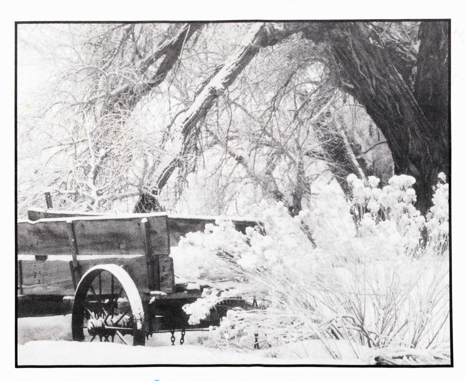
"...wash me, and I shall be whiter than snow."