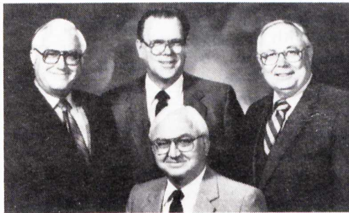
OKLAHOMA MINISTERS QUARTET

COST: Couple $70.00 Triple $30.00 per person Quad $25.00 per person