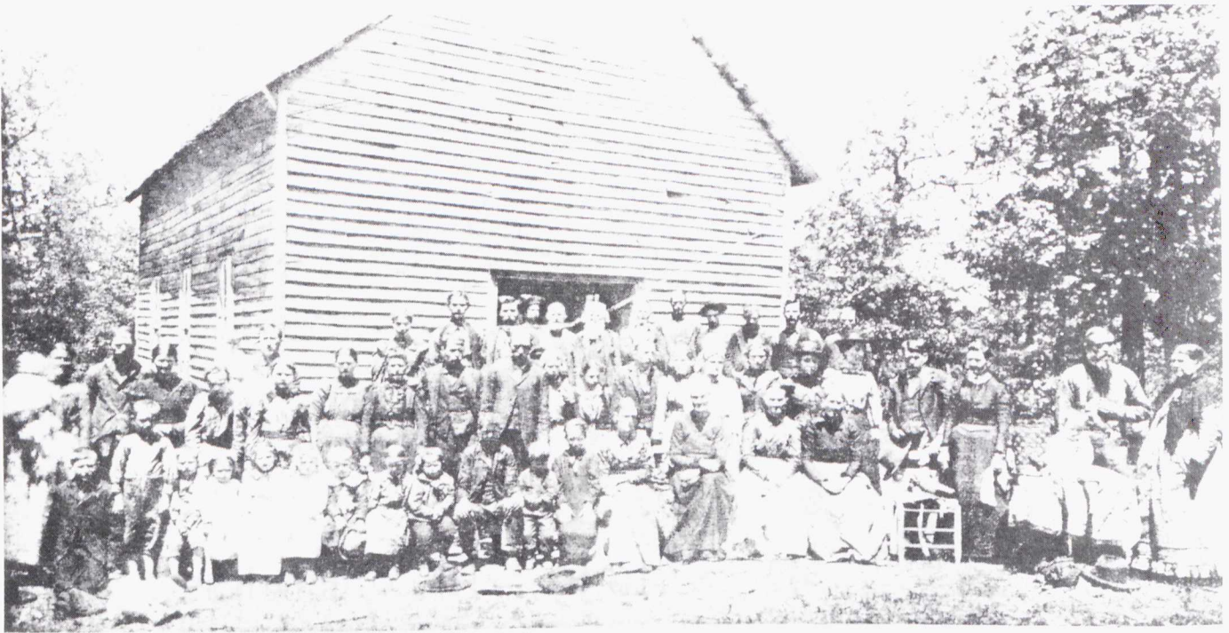
This rare photo of the Cross Roads Free Will Baptist Church was made in 1896.