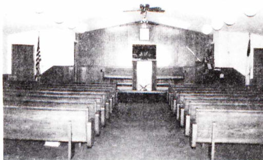
Inside Mt. Pisgah FWB Church

On Sunday, October 31, 1993, the Mt. Pisgah Free Will Baptist Church held a Dedication Service. The church dedicated its beautiful and spacious new auditorium, additional class rooms, pastor's study, and an enlarged fellowship area.