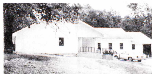
Outside of Mt. Pisgah FWB Church