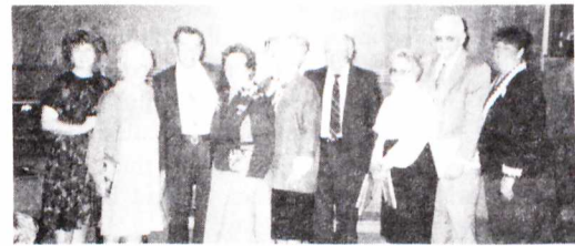
Recognized for 50 years + Service

history of the Mt. Pisgah Church. It was informative and picturesque as members of the church walked in front of the congregation displaying objects that were used in the progression of the building program.