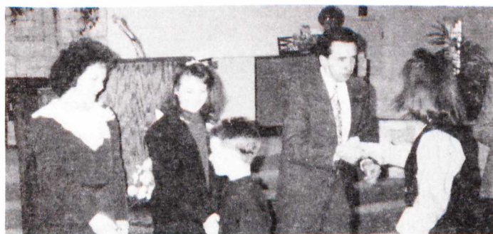
Greeting the New Pastor and His Family