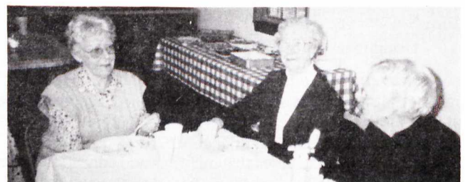
Good Food and Fellowship