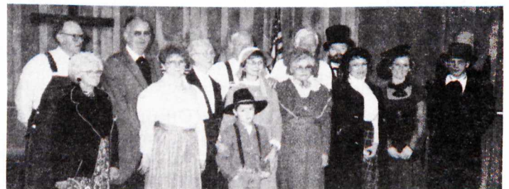
Some Dressed Old Fashioned