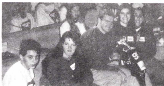
Right: Youths Enjoying the Conference