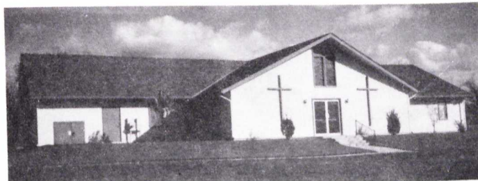
Maranatha Free Will Baptist Church Pastor Being Sought

The above is only a partial listing -- there are 177 Free Will Baptist churches in Missouri. Each church is encouraged to send in the Sunday School average each month.