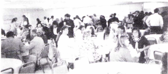
New Fellowship Hall