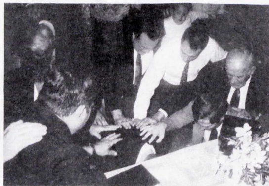
Laying On Of Hands By All Ordained Ministers Present