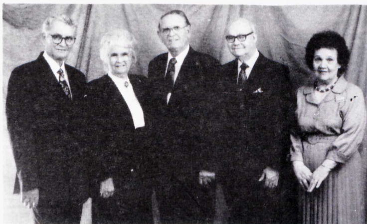
Pixley Quartet - Ft. Smith, AR

Directions: Approximately 45 miles south of Springfield, Missouri, on Highway 65 (four miles south of Branson), turn right on 265 and stay left one mile to center.