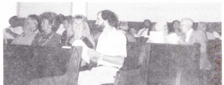
Part of the Congregation