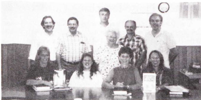
Student Meeting at the Cuba Church