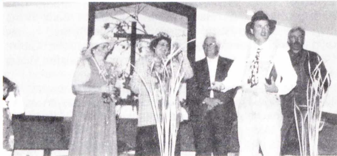
The Wedding Party

One Sunday night, in the hill country of the Ozarks, a special couple celebrated their 40th wedding anniversary in a rather peculiar way. After some gentle persuasion from a large group of friends, they repeated (to some degree) their wedding vows of years long past. The white haired groom was held, sort of, under house arrest, while the not so eager bride came forward, escorted by two of her four sons. The older son was at the altar, exerting a little pressure on the groom to stay put and say his part.