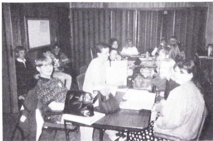
Ozark Sunday School Class

We are excited about the response from you who are sending gifts to the "Ozark Building Project" to help pay on our principal. It is really appreciated! We are thankful for the support and hard work of Missouri Free Will Baptist people and the Missouri State Mission Board.