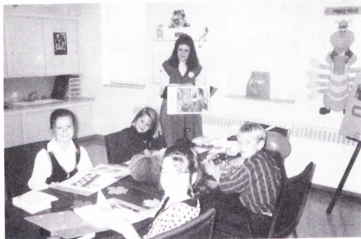
Ozark Sunday School Class