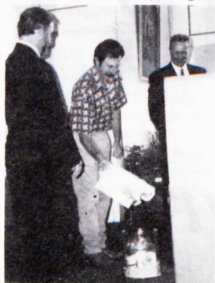
Burning the Mortgage

The First Free Will Baptist Church of Farmington held a Mortgage Burning celebration October 25. It was a time of remembering God's past and present blessings with thanksgiving and a time of anticipating what God has in store for the church.