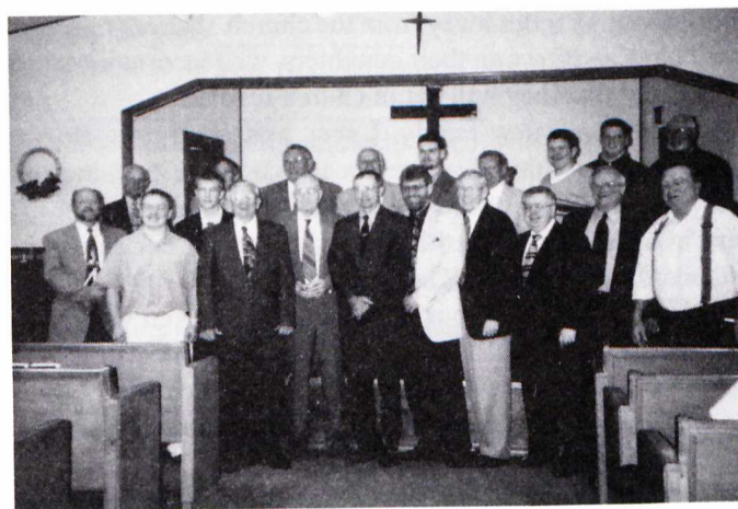
Ministers attending Saturday Session

in April 25, 1911 and Old Bethel Church was organized in 1932. The Twin Oaks Church had its beginning in 1933, and the New Hope church was received in 1975. Trace Creek, Marble Creek, Silvermines, Shady Grove, Little Rock Creek, and Marquand are a few of those churches that no longer exist as Free Will Baptist Churches. Several of the churches have undergone name changes since their inception. In 1898 the quarterly met with the Concord church, later the name of the church was changed to Union Light. Likewise, the Copper Mines church was named the Golden Gate Church in its beginning. The First Free Will Baptist church of Fredericktown was received into the association as the First Free Church.