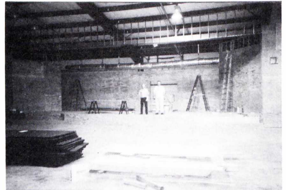
Inside New Tabernacle