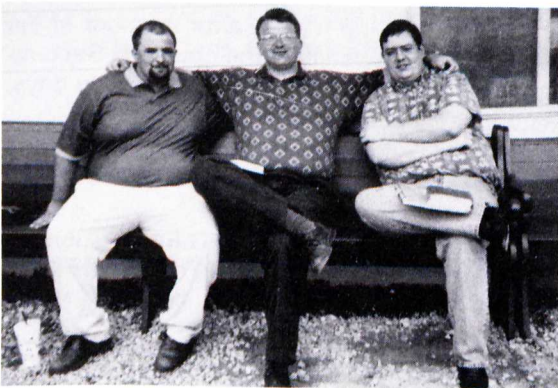
Young preachers at Wed. service