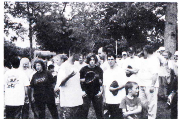
Campers assembling for dedication service.