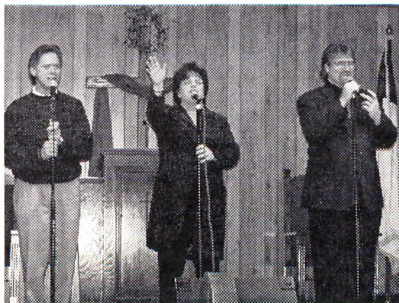
The New Horizon Singers