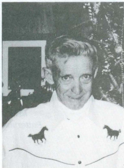
Thurman Briggs Bowditch Church