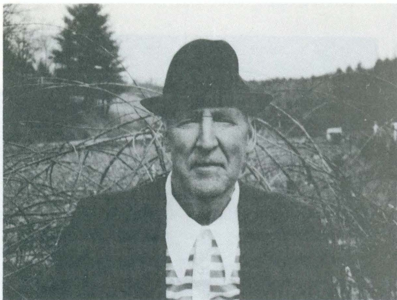
J.B. Wheeler Patterson Branch Church