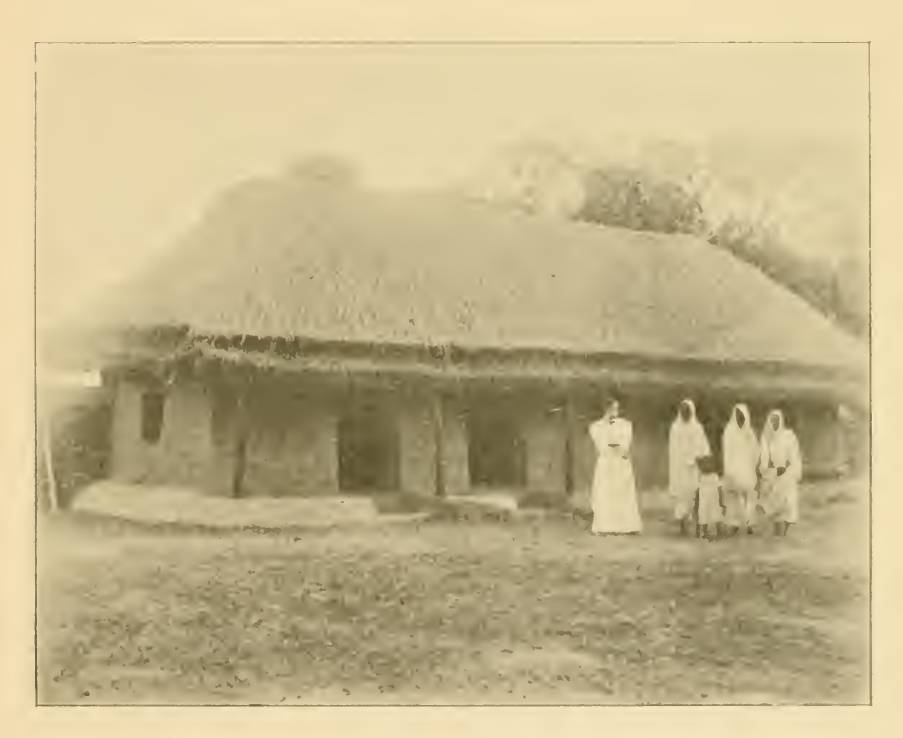
Widows' Home-Women's House, within the Compound.

This society was the fourth organization to join the council. The president and delegate have attended each triennial of the council, and at most of the annual executive sessions some representative has been actively present. By this affiliation the National Free Baptist Woman's