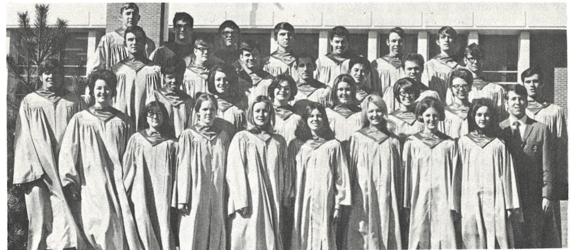
1970-71 OBC Choir