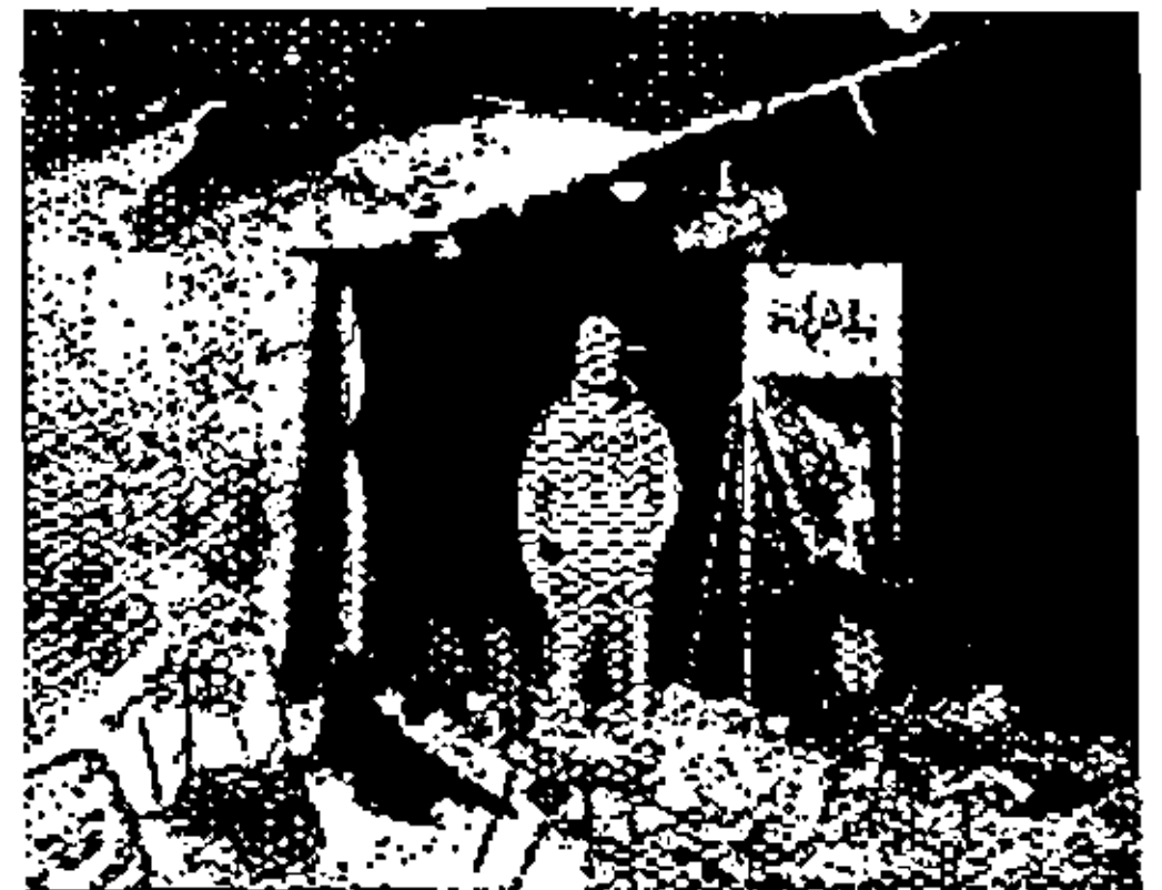
Children attending service in portable.

Real Life Church. Even after two months, we have few answers to our many questions. I pray that God will help open some new doors, while closing some others, in the next few weeks. We have spent the last several weeks operating as a portable church, which requires us to set-up and tear-down church every Sunday. During this ordeal, we have lost four (4) families that were deeply rooted into our ministries. This leaves many jobs to fill with few people. Even with all this going on, God has blessed us. I am encouraged that these events will lead us to a new level as we continue to help those in our community find hope in Christ.