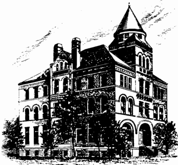
Winnebago City College.