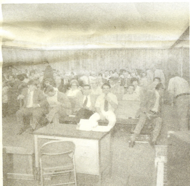
Part of those in attendance during the State Association meeting at the McCorkle FWB Church.