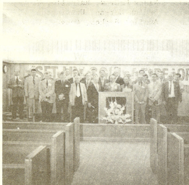
Ministers attending the State Meeting.

18. These By-Laws may be revised or changed at any regular session of the State Association provided that they be plainly written and stated one day before the vote is taken.