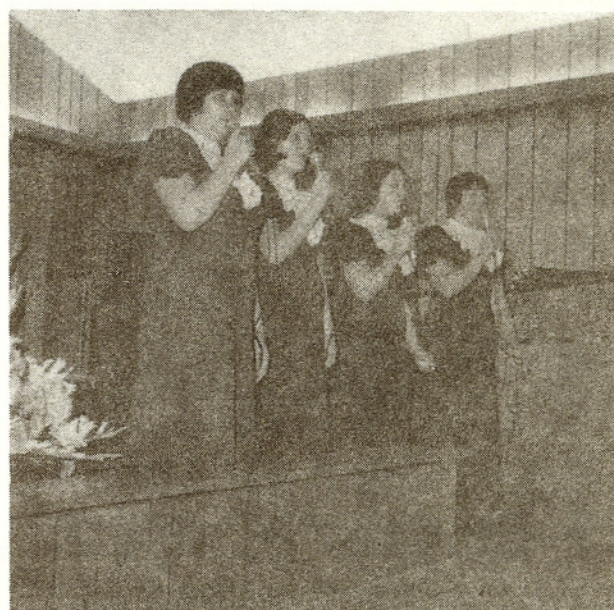
The McCorkle Singers perform on Saturday session at State Meeting.