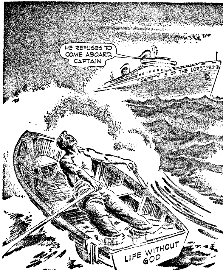
A LONESOME VOYAGE