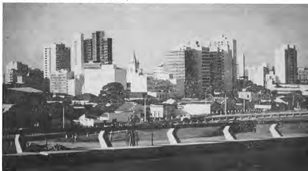
The skyline of a modern Brazilian city.