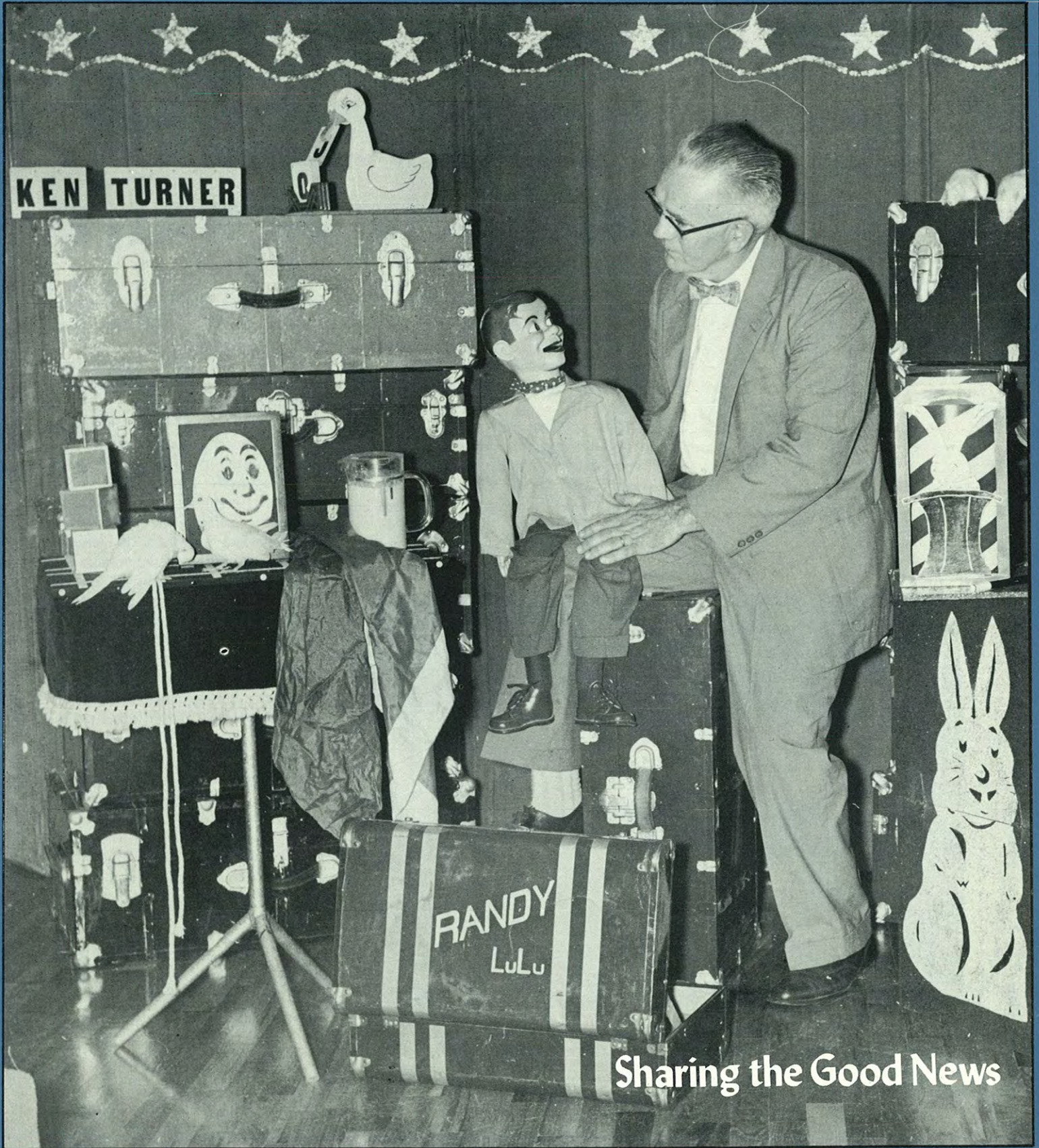
Sharing the Good News