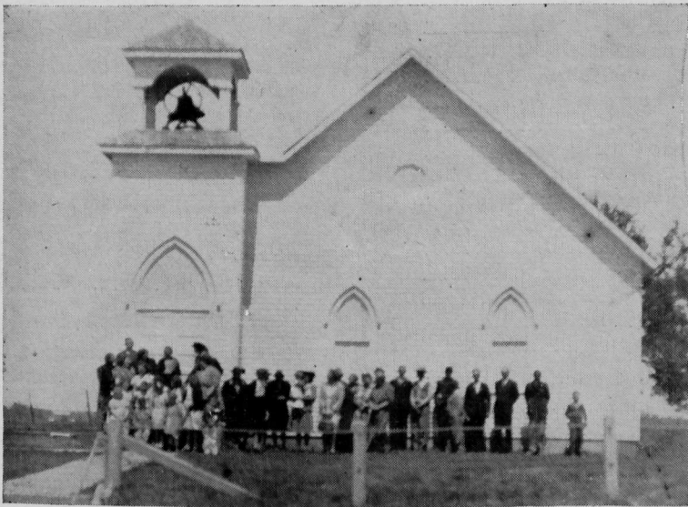
Hickory Grove Church, Haddam, Kans.

near the church; later two other rooms were added.