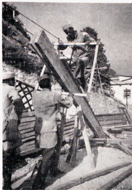
A sawmill in India.