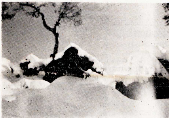
Winter scene in Landour, India.

Traveling from northern to southern India you will pass through three distinct geographical regions. The north is a mountainous region, including the Himalayas, the tallest mountains in the world. Then there is the north central valley plain, which produces three fourths of India's wheat, the most densely populated region in India. In the south, there is the low plain region, which occupies most of the peninsular portion of India. India is a land of vivid contrasts. The climate varies from low-lying, torrid tropics to frigid, snow-covered mountains. You will find arid deserts and rain-drenched jungles.