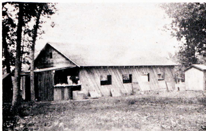
Main Auditorium of the Youth Camp.

before, with our youth ready and anxious to do something for their Christ. They continue to ask questions - Are we going to have the camp this year? Are you going to have the playground ready for the camp? - and other similar questions. They are anxious to know; for they are making plans to be there, and we cannot afford to disappoint them in this matter.