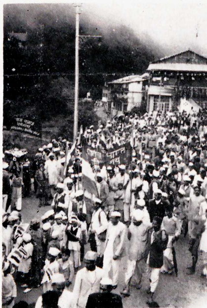
Independence Day in Landour

Since many times the acceptance of Christianity separates the convert from his former means of livelihood, the Indian Christian, too often, is apt to show a tendency to depend on the Missionary or the church to provide means for the necessities of life and sometimes is willing for the necessities to be alone (without the means). Many Indian Christians - on the oth-