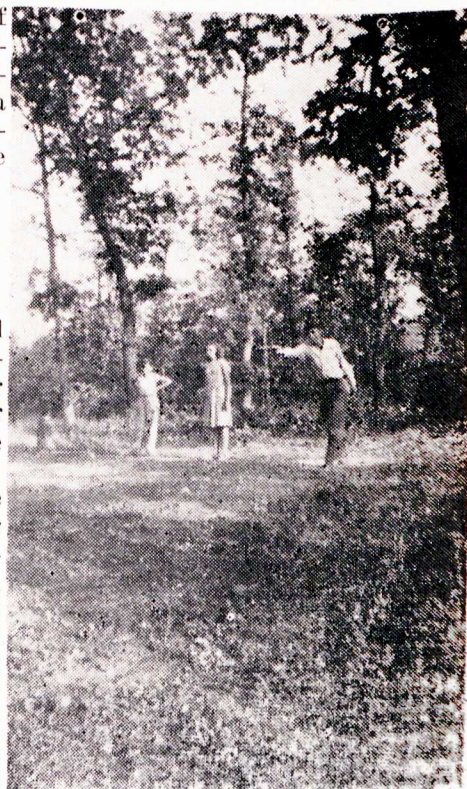
Children playing at the Youth Camp.

The old year has gone and another is here bringing us new opportunities