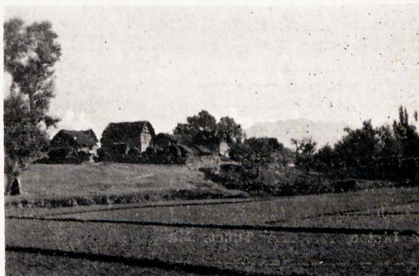
Some of India's farming land.

You will see fabulously-rich rajahs and critically-poor multitudes. You will discover the absolute monotheism (worship of one god) of the Moslems and the extravagant polytheism (worship of many gods) of the Hindus. You will meet world-renown philosophers and illiterate masses. It is a land of many bloods, colors, languages, manners, and types. India has no God in her religion. With all of her evident needs her greatest need is Christ. Even objects such as stones are adored and worshipped. Plants and trees become objects of worship and because of the Hindu belief in transmigration, animal worship is popular. Animals are, therefore, considered sacred. The cow is worshipped and revered above all. Free Will Baptists are making a contribution to India's crying need and we have plans for an immediate stepping up of our activity in that vast and needy land.