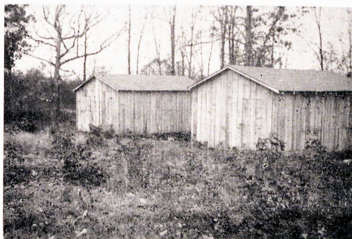
Two of the cabins at the Youth Camp.