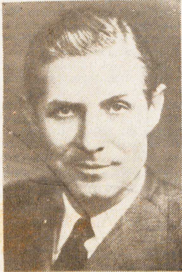
Senator Mike Monroney

The Honorable Mike Monroney, U. S. Senator from Oklahoma, will bring an address to the delegates attending the national association of Free Will Bap-