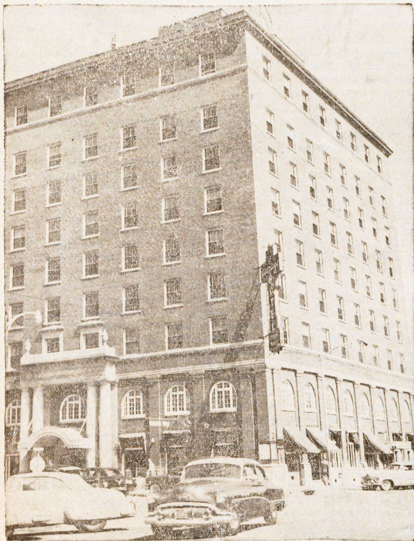
The Aldridge hotel, Shawnee, Oklahoma, is designated as Convention Headquarters. The convention office will be established there. The General Board will hold sessions there. The hotel is just two blocks from the Municipal Auditorium, meeting place of the convention.