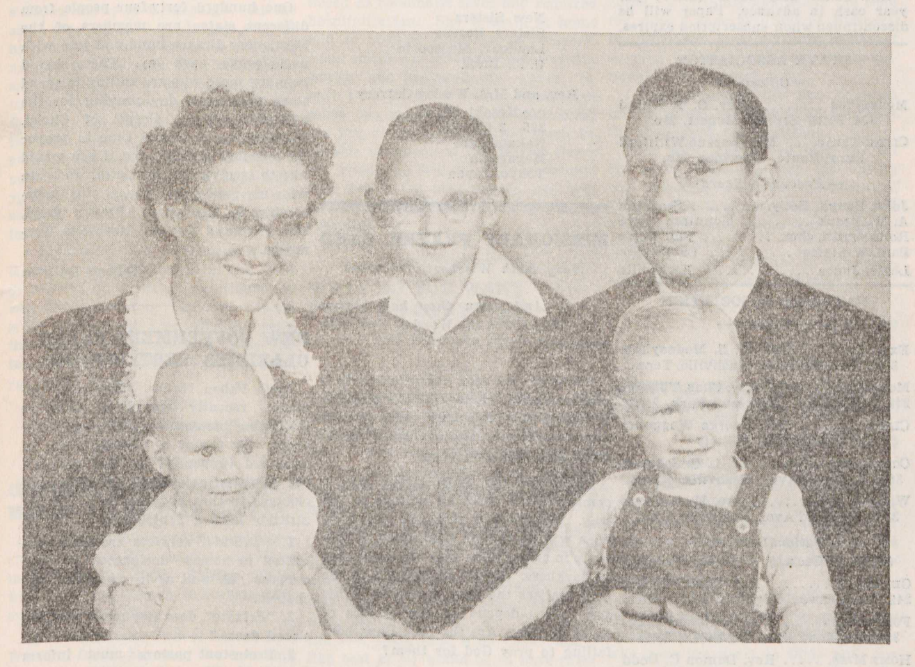
The Editor and Family extend Greetings for your Christmas Season