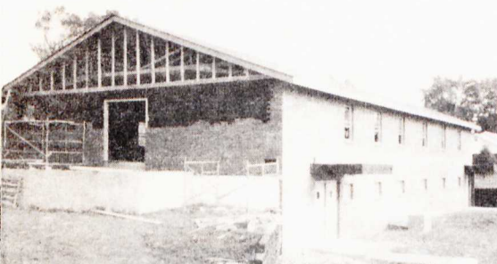
Construction of Church