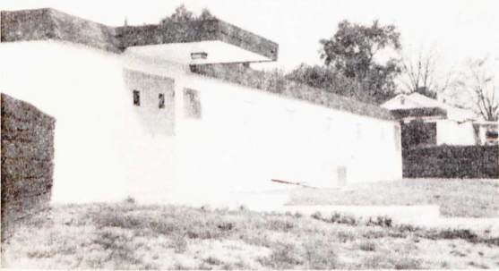
Educational building on which the auditorium was built