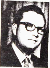
PASTOR OF JOPLIN CHURCH ANNOUNCES RESIGNATION

At the present time, this governing body has authorized OBC to operate as a junior college and to offer appropriate Associate in Arts degrees. Twenty-five other colleges and universities in thirteen states have indicated a willingness to accept students for OBC on the basis of validation.