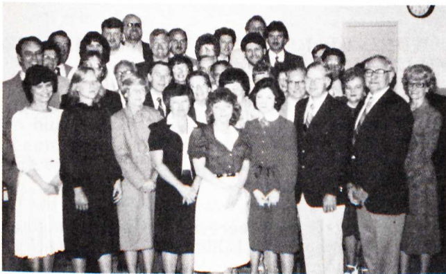
Christian Workers Appreciation Banquet-Trinity