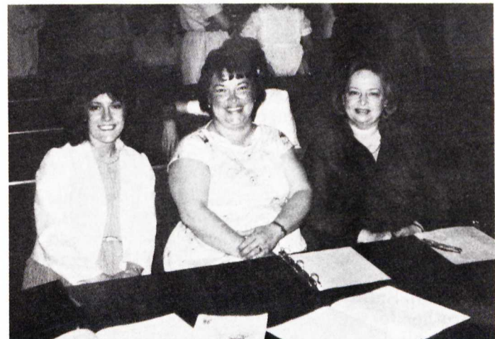
The Host Pastor