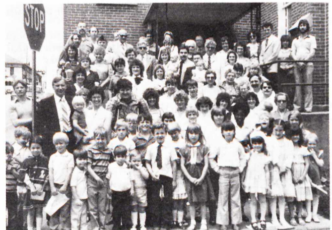
Congregation: Cape Girardeau Church