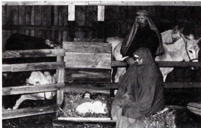
Nativity Scene At Rock Chapel

On the church grounds at the Rock Chapel Free Will Baptist Church is an unusual Nativity Creation. The Bible characters are live: Joseph, Mary, and the shepherds. But the animals are also live: the sheep, cows, and donkeys.