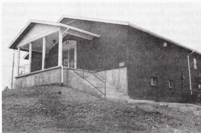
Front/Side View of Desoto Church