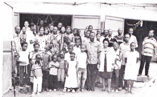
Folks at 2nd Church

Thank you for giving to the Third Church Building/ Parsonage Fund. The 2 Feb, '06 report showed a total of $97,000.00. THANK YOU SO VERY MUCH. Four lots have been purchased. Due to the ongoing turmoil, protest and lack of Government official cooperation, we are still waiting for the paperwork to be completed. Until it is done, we are at a standstill.* However, other options are being considered. We hope to send great news soon! Please remember that in Africa soon can be tomorrow, next week or next month....we wait in the Lord knowing this is His work. We appreciate so much your praying and giving and caring.