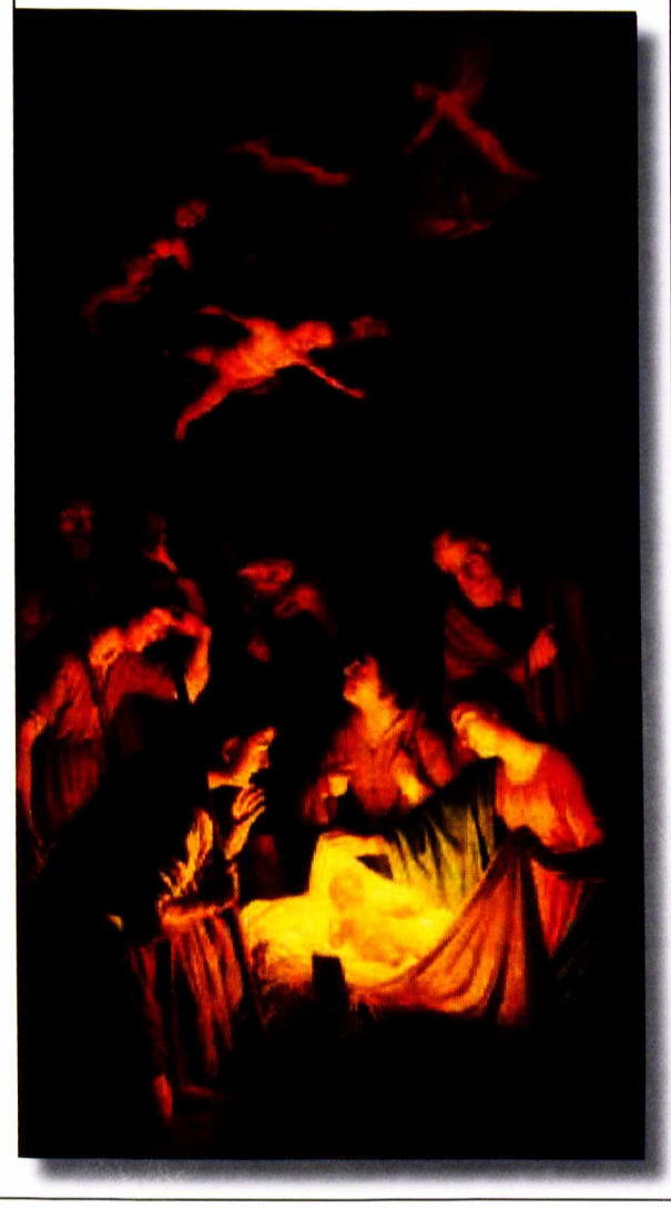
Page 3 Gem/ December 2008

And I am sure we were not worth it. But aren't you glad God does!